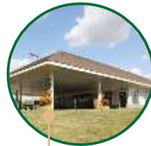
Four Seasons Pavilion