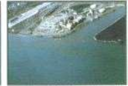
1987: Mouth of the Rouge River as it empties into the Detroit River