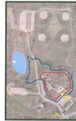
Short Distance Paths — 1/3 Mile — 1/2 Mile

Township Park offers several barrier-free walking paths to accommodate all ages and fitness levels. Each path differs in location and distance and provides points of interest and beauty along the way.