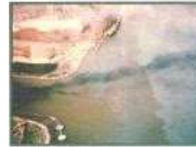
1950: Mouth of the Rouge River as it empties into the Detroit River

Clean up of polluted waterways can result in high costs for communities.