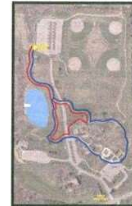
Medium Distance Paths — 4/10 Mile — 6/10 Mile