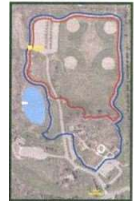
Long Distance Paths — 7/10 Mile — 9/10 Mile