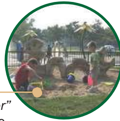
"Friendly Monster" Dragon Sculpture