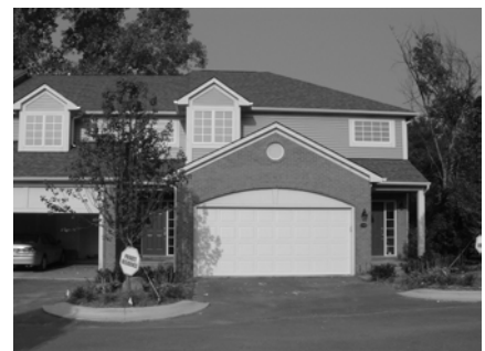
Riverbend Condominiums are at the corner of Northville Road and Edward Hines Drive.