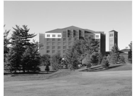
The Inn at St. John's is a welcome addition to the St. John's Golf and Conference Center.

New condominium developments are also under construction in the Township. Several projects have already been completed and more are in the planning or construction phase. Condo-living appeals to a wide range of age groups from young adults just starting out on their own to empty-nesters looking to downsize to seniors looking to remain independent.