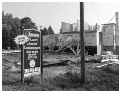
Saddlebrook Condominiums are located on McClumpha Road near Ann Arbor Road.