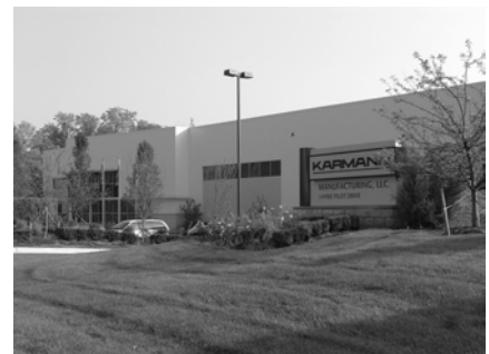
Karmann Manufacturing expanded its Plymouth Township operation in 2005.