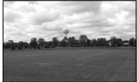
Lake Pointe Soccer Park offers two soccer fields for league play, a picnic and children's play areas, restrooms, and a shelter available for rental.

Some of the many features of the park include one large and one smaller soccer fields, surrounded by a walking path. There are restrooms and a shelter, which is