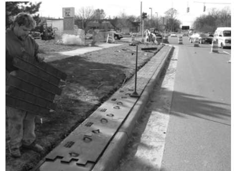
A stamped concrete verge is being installed along the Ann Arbor Road corridor (above). New sidewalks will help to make the area more pedestrian-friendly (below).

This portion of the streetscape project is anticipated to be completed by late summer. As more money becomes available, the DDA looks to continue the beautification, moving west from Haggerty Road to just west of Sheldon Road.