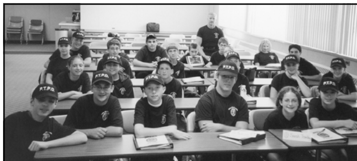
2002 Plymouth Township Police Youth Academy Class

The Plymouth Township Police Department held its second Youth Police Academy in July for 23 Plymouth-area middle school students. During the week-long program the students learned about topics such as criminal law and the judicial system, police patrol operations, crime scene and accident investigations, among others. The participants also observed a K-9 demonstration and took part in a firearm simulation exercise. The program wrapped up with written and physical testing, followed by a pizza party and graduation ceremony.